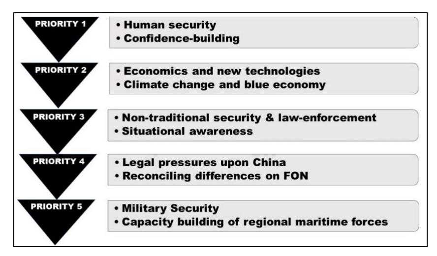
Figure 3: Thematic Prioritisation for Indo-Pacific Cooperation

Regional cooperation would need to be multi-faceted to attain the objectives of holistic security, and the various themes prioritised based on their relative exigency in the prevailing circumstances. Accordingly, a suggested generic prioritisation chart is depicted in Fig. 3 below, which bears an indicative list of issues.