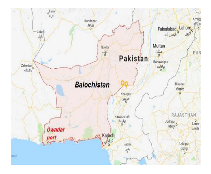
Figure 1 Map of Baluchistan (source: Google map)

offers the shortest passage to the Middle East and Central Asia. Therefore, Gwadar has excited foreign investment and numerous development schemes (Javaid and Jahangir, 2015). The enlargement of projects over the past ten years has boosted the demand for Baluchistan electricity. Current demand for electricity in the region is around 1650MW, but finite 400-600MW is provided. The huge electricity deficiency will take place in urban areas for 10-12 hours. The condition of power failure is terrible in countryside, where generally 85% of Baluchistan is living at 13.16 million and electricity in rural areas is only available 3-4 hours per day (Siddique, 2016).