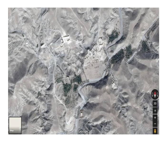
Figure 4 Road to Tor Tang village [Google Earth]

Tor Tang (Study Region) This region is located at the North-East of the Pishin City at about 70 Km. It will almost take 3hours to reach there because of narrow, rough roads and hilly areas. This village is far scattered in Pishin district deep inside the mountains, the latitude and longitude of Tor tang is 30.55'3 N and 67.26'0' E with an Elevation of 1,555 meters.