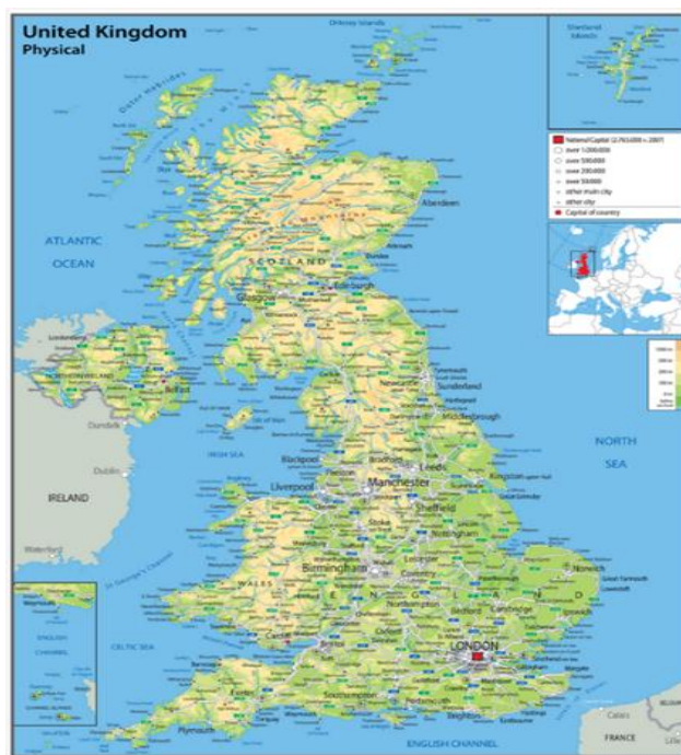
Figure 1: Research Location

Nakamura and Takai (2014) employed a comparable methodology to analyze the dominant energy sources across 89 vent fields. Their study included a range of hydrothermal fluids: hydrogen and methane fluids environments and fluids from rocks sediment high levels of methane and ammonium. Hydrogen sulfide is the primary resources of hydrothermal vents, on other cases where end-member fluid/seawater dilution ratios were very low. However, they found that fluctuations in H 2 S concentrations had minimal effects availability for sulfur-oxidizing microbes (thiotrophs). This also indicated that availability was not significantly affected by the rate of fluid mixing, implying hydrogen sulfide is probably not a limiting factor the production. Instead, primary constraint on overall energy was the provide of oxygen, which was the electron for sulfide oxidation. The study did not take into account of any oxygen in seafloor, which may have resulted in an incomplete assessment of the cycle of energy on microbial things. In contrast, in hydrogen on hydrothermal vents, both two conditions, anaerobic and aerobic appear to be more energetically favorable compared to sulfur oxidation (thiotrophy). Unlike sulfur, changes in hydrogen in the hydrothermal significantly influence productivity of energy. In the same conditions, chemical concentrations are believed to greatly affect microbials in hydrothermal systems.