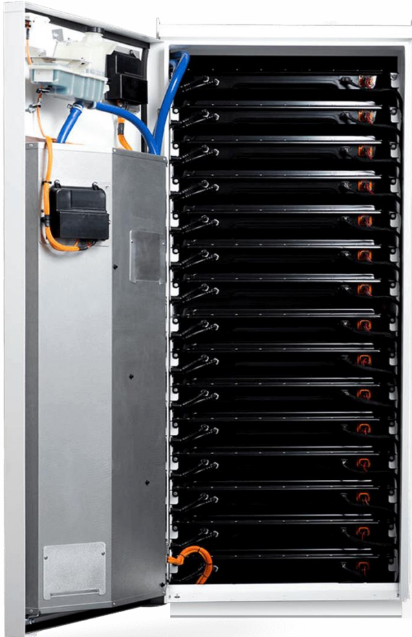
Figure 2. A typical Tesla Powerpack with 16 battery pods (Tesla Australia & New Zealand, 2025)

storage hybrid systems, and short-term backup storage.