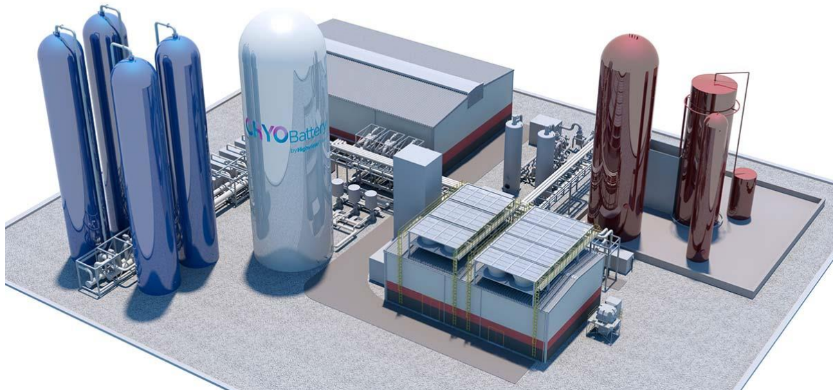
Figure 3. Liquid Air Energy Storage design called CRYOBattery (Sumitomo SHI FW, 2025)

LAES has a higher initial investment than batteries (~$2,000/kW) but lower lifecycle costs. Integration with Indonesia's LNG terminals like Bontang and Tangguh may increase its feasibility. LAES is ideal for grid-scale storage and industrial energy applications.