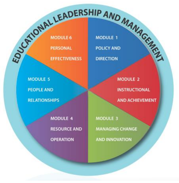
Figure 3. NPQEL Curriculum Model

The new mode NPQEL curriculum was formulated using the domains in School Leaders' Competency Model developed in IAB. The curriculum contains the basic module which is the Educational Leadership and Management overarching the six main domains; policy and direction, instructional and achievement, managing change and innovation, resource and operation, people and relationships, and personal effectiveness (Figure 3).