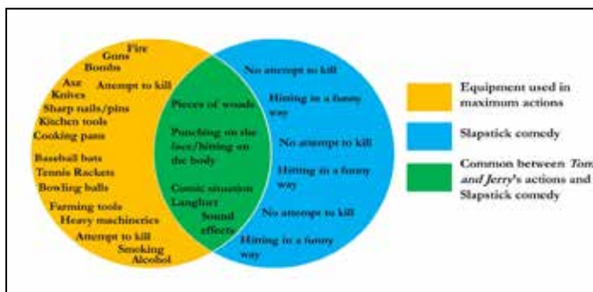
Figure 5: The Ven-diagram of Tom and Jerry 's actions compared with slapstick comedy.

If the definitions of a ‘slapstick comedy content’ given by the experts and scholars are compared with the actions displayed and in Tom and Jerry , it will be quite transparent that the comedic violence that is displayed in Tom and Jerry are less comic and more violent. Where the experts and researchers have defined the slapstick comedy as non-harmful for the characters, Tom and Jerry has always been displaying violence rather than slapstick comedic violence which in almost all the episodes of the cartoon bring minimum harms to the characters that are involved in the actions. With an attempt to be humorous, the cartoon turns into a solid display of violent actions with weapons. Besides, the actions that Tom and Jerry claims as slapstick comedic-violence, often overlooks the definition of the comedic-violence. Although, in many cases, Tom and Jerry has maintained only a few of the traits of a slapstick comedy. The following Ven-diagram (Figure 5) presents the comparative image of the actions performed (with different equipment) by the various characters in Tom and Jerry and slapstick comedy.