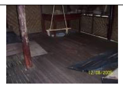
Gaps between the floorboards solved problems of house cleaning, ventilation and also lighting.