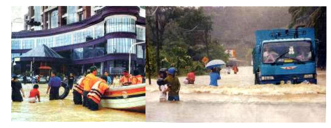
Figure 9: Flood causing havoc to daily activities

construction. In the old days, houses were built on stilts, not only to prevent wild animals from entering the house but also to avoid flooding. It is not impossible for buildings to be built this way today?"