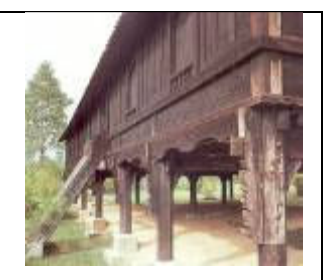
The raised floor of the traditional Malay house is an effective counter measures from flood, wild animals and etc. It allows easy passage of air into and through the house.

The area beneath the house is comfortable for children to play and various daily activities.