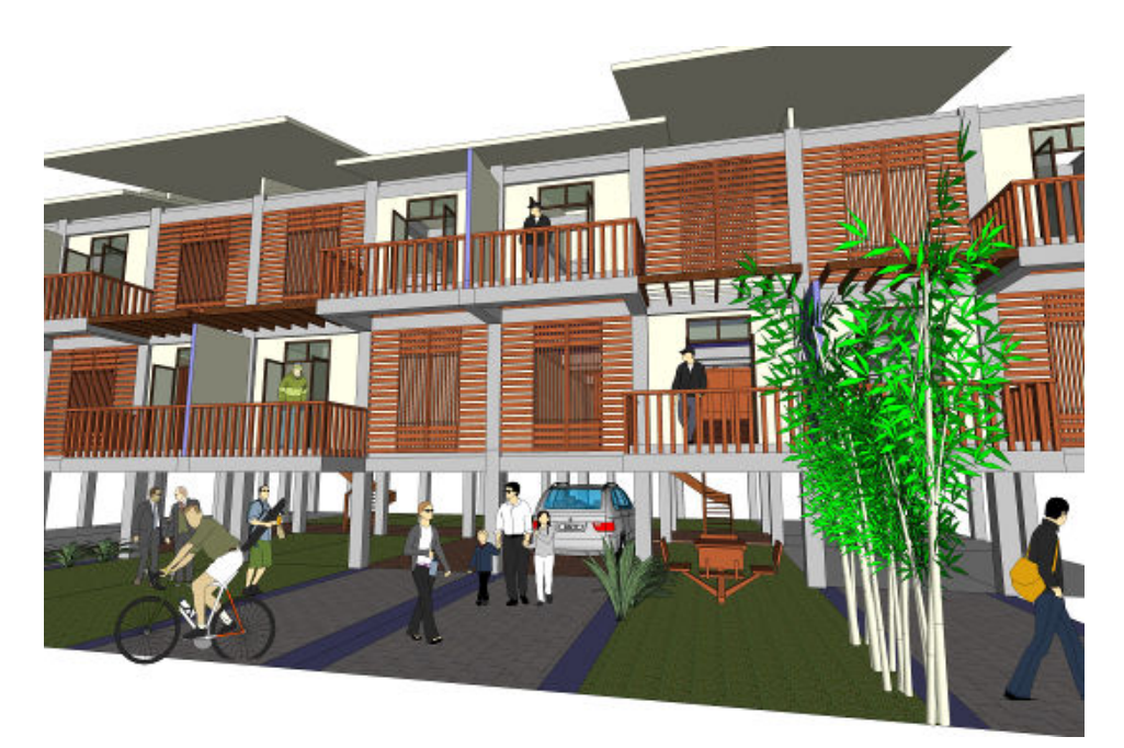
Figure 4: Raised Floor Terrace Housing Concept