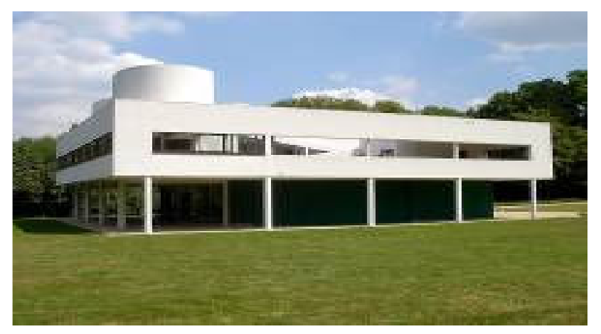
Figure 3: Villa Savoye - Main building mass is raised on columns

What this does is literally and figuratively separates the house from the ground ( Figure 3 ). It is an interesting contrast to other design philosophies that seek to merge the dwelling with the earth, and to incorporate the experience of a tactile terra firma or ground in a design. However, the disassociating of the house with the ground does allow the perception and experience of the house to be more cerebral. It allows one to fully appreciate the absolute harmonies to which the composition is attuned.