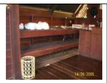
Gaps between the floorboards under kitchen shelves for ventilation purposes.