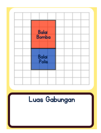
Figure 2. Combine Area Activity

Furthermore, the difficulty may emerge from a simple misunderstanding of terms or from deeper misunderstandings that lead learners to believe that perimeter and area are simply related in such a way that an increase in one lead to an increase in the other. Next, knowledge of shapes and their sizes is critical to developing the foundations of a child's mathematical reasoning. Spatial thinking is essential for solving issues and representing mathematics in many forms such as diagrams and graphs (Huang & Witz, 2011; Perry & Perry, 1981). Instruction that reproduces the counting of squares on grids leads to better success and may represent the concept of space filling (Murphy, 2012). As a result, the goal of this research is to create an alternate module for measuring Year Five National School children's geometrical measurement skills and to evaluate the module in terms of content validity and face validity.