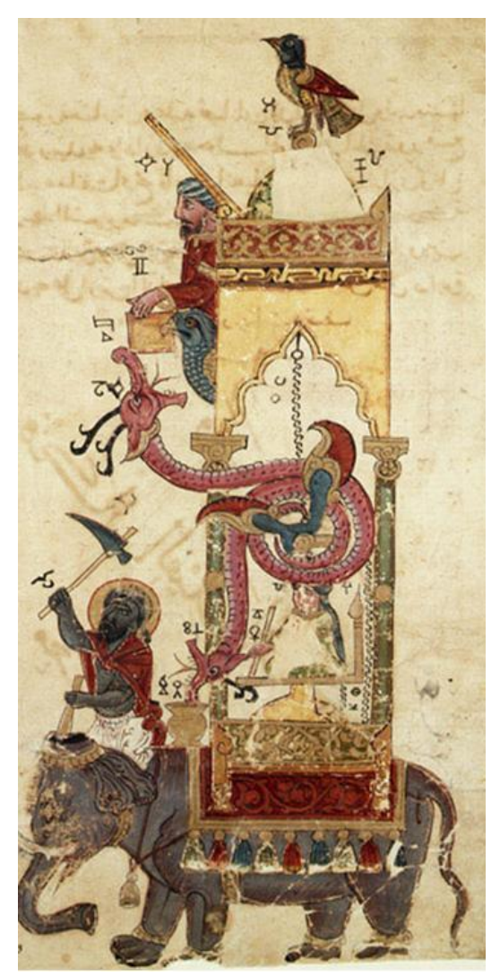
Figure 2. Drawing of al-Jazari's "Elephant Clock."