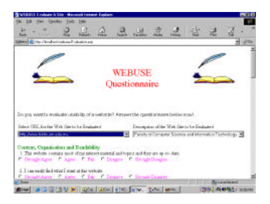
Fig. 3: Sample Screenshot of WEBUSE

Overall, participants were satisfied with WEBUSE. The mean value for positive feedback given to the 10 questions is 85.75%. This is an acceptable result but improvements could be done on the user interface design and interactive features as more than 25% of the participants gave negative feedback to these two aspects. Fig. 3 is a sample screenshot of WEBUSE.