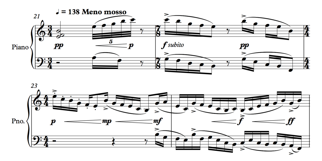
Figure 2. 'Puteri Gunung Ledang' (2015) for solo piano by Marzelan Salleh showing Gamelan nuances for Slendro and Pelog

I have used these two modes separately and at times together in juxtaposition or followed by one another in a dovetailing manner thus creating harmonies or heterophony texture within this piece (Figure 2). And at times, more often than not, I begin the slendro and pelog scales from different degrees, meaning not only starting from the beginning of the slendro or pelog scale but from different notes in the scales. This directly gives an audibly different sense of colour instantly.