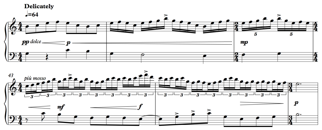
Figure 3. Gamelan-like scales accompanied by kenong counter-melody

As shown in Figure 1a and Figure 1b, both gamelan scales in Puteri Gunung Ledang are in the white keys without any chromatic inflections or passing notes. Therefore, one might expect to hear in this piece an open sound of non-tension. But to counter and create tension here in this music, I have inserted minor second intervals and tritone intervals from the gamelan scales, thus naturally adding colouristic qualities to the music (Figure 4). These notes, which I refer to as 'interferences', are added to the aesthetic of the music. They are merely intuitive inflections and are not related to any chromaticism or tonality relations.