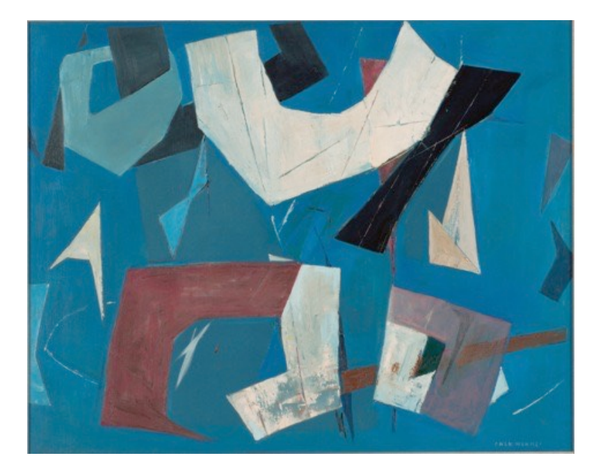
Figure 2. Chen Wen Hsi, Abstract Cranes , 1960s, oil on canvas, 110 x 100 cm, Collection of National Heritage Board, Singapore.

Western art has a particularly strong influence on my Chinese paintings in terms of composition and layout. Breaking away from established conventions on layout [in Chinese painting], I paid special attention instead to Western theories on compositional format, studying their aesthetic principles of harmony, contrast, symmetry, rhythm, balance and so on. (2006: 66)