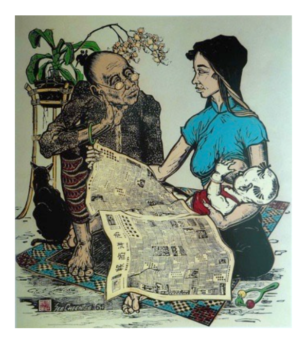
Figure 6. See Cheen Tee, Three Generations , 1965, Woodblock Print. 62 x 49 cm, Collection of See Yee Wah.

Daily rituals of life at the kampung or the fishing village were a recurrent theme and subject matter in many works (see Figure 7). Attap houses, ubiquitous in Southeast Asian vernacular architecture were frequently featured (see Figure 4 above). The artists also depicted the socializing of the three major ethnic groups, the Malay, Chinese and Indian communities. They are usually differentiated by their attire, their distinctive facial characteristics and portrayed within an unhurried, carefree environment. Similarly, the theme of leisurely kampong life is carried through in Liu Kang''s Painting Kampung . In this example, the gathering of the kampong folk around a Chinese artist expressed in naiveté tone of flat shapes and colours reflect the unfettered living in the kampung. The naive treatment of colour and form reflect the innocence of village life where differences in ethnicity are less affected by the politics of identity.