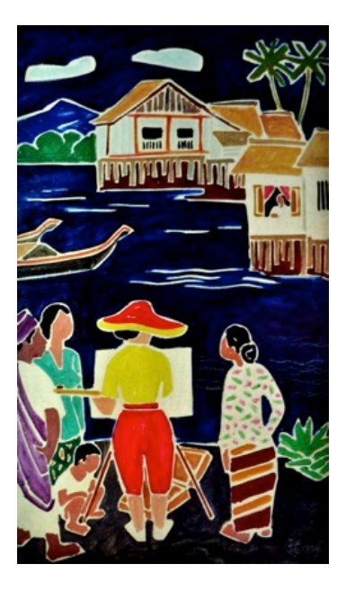
Figure 7. Liu Kang, Painting Kampung , 1954, Oil on canvas, 120.5 x 71 cm, Collection of National Heritage Board, Singapore.

Daily rituals of life at the kampung or the fishing village were a recurrent theme and subject matter in many works (see Figure 7). Attap houses, ubiquitous in Southeast Asian vernacular architecture were frequently featured (see Figure 4 above). The artists also depicted the socializing of the three major ethnic groups, the Malay, Chinese and Indian communities. They are usually differentiated by their attire, their distinctive facial characteristics and portrayed within an unhurried, carefree environment. Similarly, the theme of leisurely kampong life is carried through in Liu Kang''s Painting Kampung . In this example, the gathering of the kampong folk around a Chinese artist expressed in naiveté tone of flat shapes and colours reflect the unfettered living in the kampung. The naive treatment of colour and form reflect the innocence of village life where differences in ethnicity are less affected by the politics of identity.