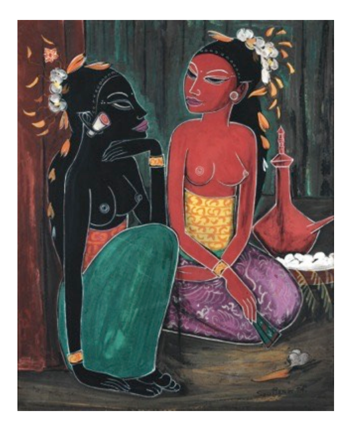
Figure 5 . Cheong Soo Pieng, Balinese Maidens , 1954, Gouache on board, 75 x 60 cm, Collection of Ong Yew Huat. Photo: Ong Yew Huat

In conclusion, we recapitulate that by locating their artworks within the discourse of diaspora, we can see how hybridity here emerges as a form of "play" — a to-and-fro exchange between cultures that acknowledges both similarities and difference without hostility. In many instances, the differences are allowed to exist side by side, similarities overlap and relate to each other, just as ambiguities are left unresolved.