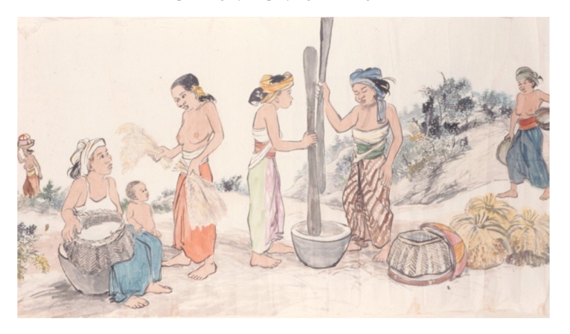
Figure 3 . Chen Chong Swee, Pounding Rice , undated, Chinese ink and colour, 117 x 242 cm. Collection of National Heritage Board, Singapore.

decrease in size. However, this compositional method is combined with the use of a balancing centre<sup>7</sup> provided by the rice pounder which establishes a stabilizing centre on which the eye is brought back to the middle. The informal (as contrasted to a symbolic or didactic orientation in Chinese traditional painting) character of the painting is accentuated by the casual conversation of the women in the foreground and the passing of the women at the back. The heads of the figures also seem to be larger in size which is a practice in Chinese traditional painting where the size of an object or figure is determined by its significance as a subject in the painting rather than its actual physical size. Chen also introduced Western naturalism in this painting by employing subtle light and shade as well as naturalistic colour.