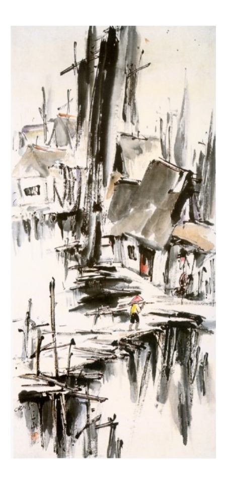
Figure 4. Chung Chen Sun, Fishing Village. 96 x 46 cm, 1965, Collection: National Art Gallery.