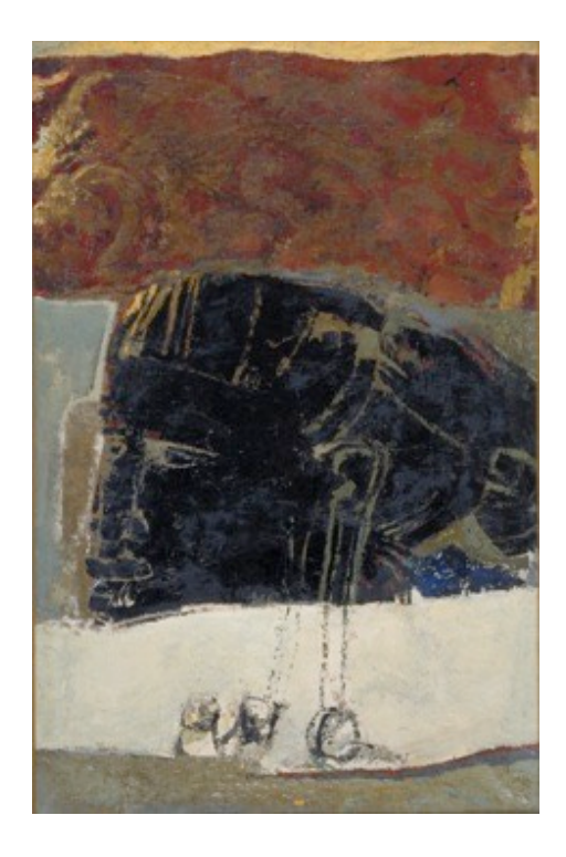
Figure 1. Yeh Chi Wei, Portrait of a Dayak Lady , Oil, 95 x 62 cm, 1969, Collection of National Heritage Board, Singapore.

boundaries" (2010: 14-21). Yeh's pictorial language that places the natives of Malaya and Borneo as cultures of antiquity by way of a Chinese art form demonstrated his identification with them.