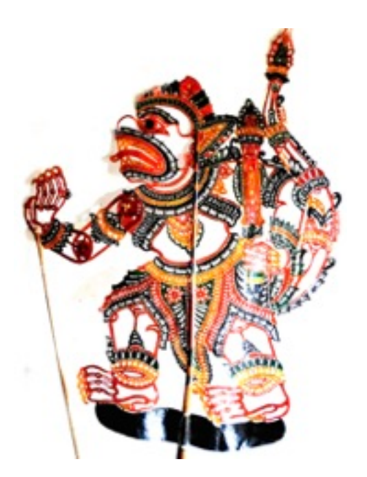
Figure 4. A Hanuman puppet made by the late dalang Pak Yusoff. The Hanuman puppet is intended to be portrayed as white in colour, but Pak Yusoff instead carved this particular Hanuman puppet in an inverse manner, leaving only the skeletal form and outline of the entire figure, thus portraying an almost see-through and translucent effect when placed against the white screen during the Wayang Kulit Kelantan performance.

A visual comparison of these three Hanuman Kera Putih puppets reveals that the three dalang have different preferences and usages of colour, texture, and style in puppet design, although the basic physical characteristics and features of Hanuman are still maintained. Each dalang or puppet-maker has a unique approach and treatment of his puppet design of Hanuman based on his intentions—Pak Yusoff carving out Hanuman's "flesh" area instead of the outlines; Pak Dain painting the full figure in red to show Hanuman's ferocity during battles; Pak Hamzah painting Hanuman half-red and half-white to show his fierceness but retaining his "original" white colour as reflected in his name.