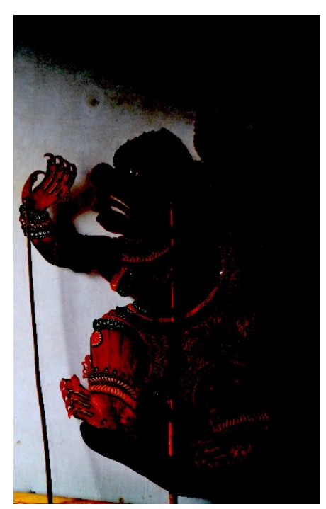
Figure 6. Another different design of the Hanuman puppet made by the famous late dalang Pak Hamzah. This Hanuman puppet is painted half red and half white – red face and upper torso, off-white or light yellowish-white coloured limbs, as well as an orange-coloured tail. Note the difference in motifs and patterns on his Thai-style trousers, as well as the fifth claw of his two feet is faced in opposite direction from the other claws.