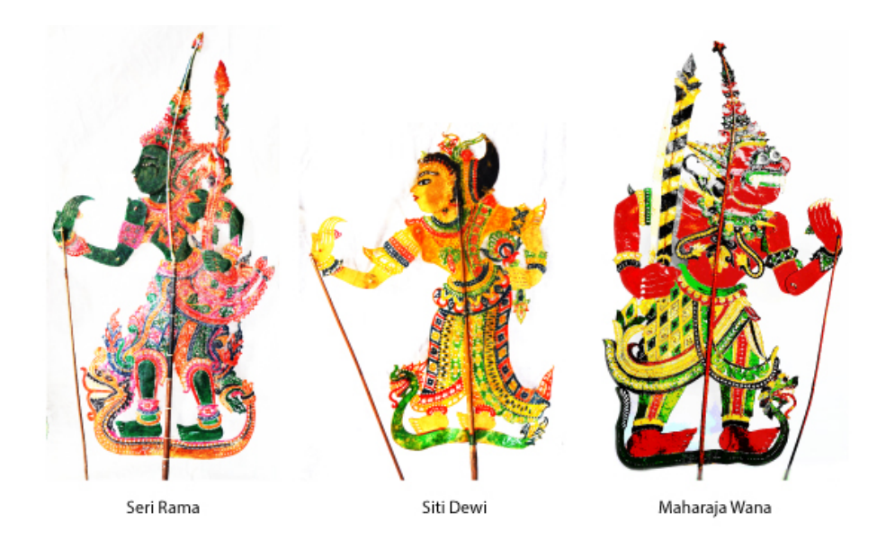
Figure 1. Seri Rama, Siti Dewi, Maharaja Wana. These puppets were made by the famous late dalang Pak Hamzah. Note the puppets portray influences from different traditions or cultures from the India and Southeast Asian regions (Photograph by Wong, 2016).

Hanuman Kera Putih is one of the more popular characters in Wayang Kulit Kelantan , especially when it comes to the battle scenes in the story and performance. The symbolism of the Hanuman puppet design will be analysed in terms of form, texture (motifs), and colour. The visual analysis will also highlight the influence of foreign cultures in particular Indian, Thai and Javanese, as well as the syncretism of cultural design elements with local cultural motifs.