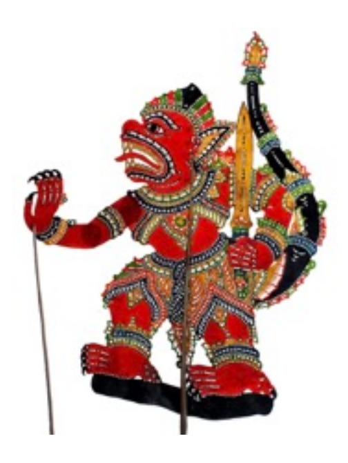
Figure 5. A different Hanuman puppet design made by the dalang Pak Dain still active in the local Malay shadow play scene. This Hanuman puppet is painted entirely in red colour, but with a black-colour tail. This is due the dalang 's intention to portray Hanuman in a fury and ferocious state when engaged in battle with Maharaja Wana's army, which this puppet will be used by the dalang when narrating that section of the story or repertoire (Photograph by Wong, 2016).