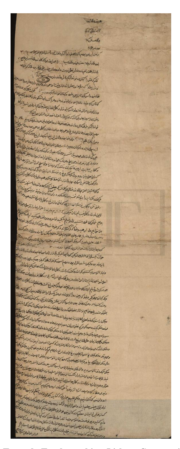
Figure 1: Torre do Tombo archive, Lisbon, Cartas orientais 33. The 1519 letter from Melaka

The author concludes the letter by insisting on the lawfulness of his conduct, requesting the grant of the cinnamon monopoly,<sup>22</sup> and by expressing the hope that his sons will pray for the long life of the king of Portugal ( bar 'umr-i jāndāzī <sup>23</sup>- yi pādshāh-i Purtūgāl du'ā yād bāshand umīd-ast ). It seems most likely that the addressee is in fact intended to be the king, or else a senior Portuguese official close to the court. The addressee's help is implicitly required in exonerating the author and restoring his confiscated wealth.