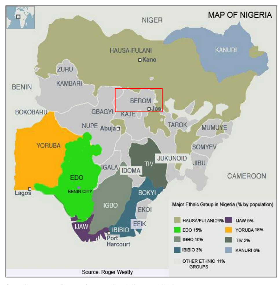
Figure 1: Map of Nigeria Showing the Location of Berom Land