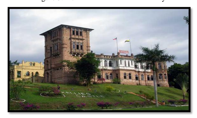
Figure 3: Kellie's Castle or Kellie's Folly

The castle would be an anachronism in today's world, but it is remarkable in encapsulating the ambitions and endeavours of a man in the 20<sup>th</sup> century who in build with care and concern for climate and family comfort, to impress and to function as a home and in doing so achieved a unique blend of architectural motifs and combined them overall with the openness of the Malay domestic tradition.<sup>14</sup>