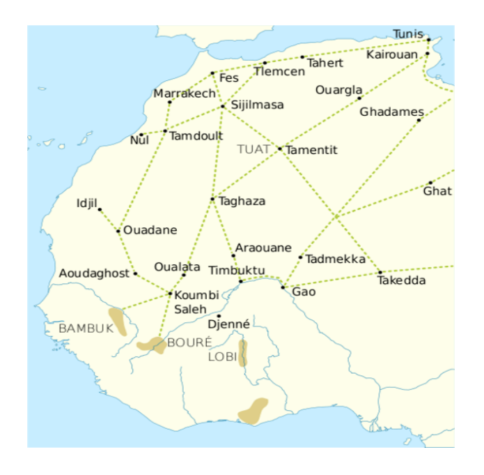
Figure 2. Map Showing The Trans-Saharan Trade Routes