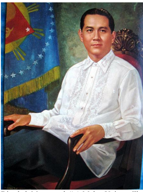
DiosdadoMacapagal: " A Malay Union will forge 40 million Malay people into one solid bloc."

Macapagal envisioned that the Malay confederation will supersede the soon to be formed Federation of Malaysia. According to him "At the time when colonial powers were liquidating their empires in our region the time has come when we, the Malay people, must try to discover a new and broader basis for more effective cooperation and unity... I do not believe that we should leave the vital task to the outgoing colonial powers. This is a task that we Malay peoples must ourselves do... "<sup>36</sup>