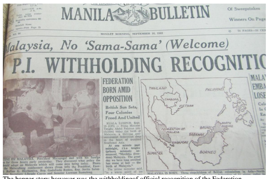
The banner story however was the withholding of official recognition of the Federation of Malaysia. (ManilaDaily Bulletin)

Front page newspaper articles on the inauguration of the Federation of Malaysia . The loss of diplomatic status of the Philippine and Malayan embassies following Malaysia's inauguration is discussed in the article on the left side of the page. (Manila Bulletin)