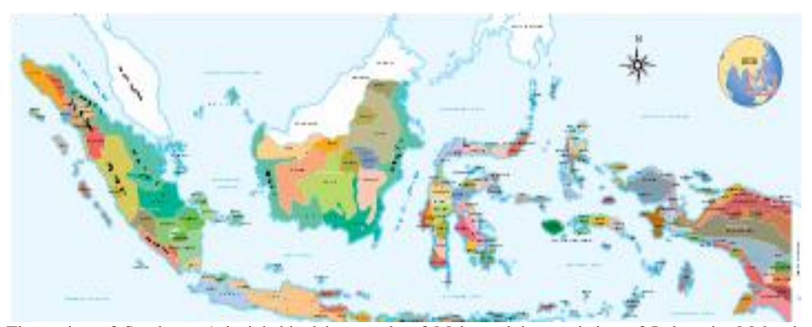
The region of Southeast Asia inhabited by people of Malay origin consisting of Indonesia, Malaysia, Brunei and the Philippines: The Great Malayan nation should be revitalized according to Irredentist views and should cast out their differences brought about by Western colonialism.

In the 19<sup>th</sup> century Filipino reformists and revolutionaries such as began to look at the past as inspiration for their nationalism. They realized that European colonization created a national amnesia which made the Filipinos to forget their noble past and had created barriers which shut off free contacts and commerce. Both reformists and revolutionists envisioned the restoration of this once free union of the Malay people once enjoyed by their ancestors. One of the early exponents of the rebirth of a Malay union was none other than the person whom the Filipinos considered as their foremost hero, Jose Rizal. During his time Rizal envisioned a union of peoples of Malay origin who lived in the Philippines, the East Indies, Malaya and Borneo.<sup>1</sup> Rizal learned about the Philippines' Malayan link through the Malay language. In his exchange of letters with Austrian anthropologist Ferdinand Blumemtritt, Rizal learned that some terms in the Tagalog language was used by many Malay peoples. One such example was the word Bathala , the Tagalog word for God which was derived from the Sanskrit bhatarra which means Lord. For the Malay people the word batara was derived from its Sanskrit origin and it was used to refer to supreme divinities.<sup>2</sup>