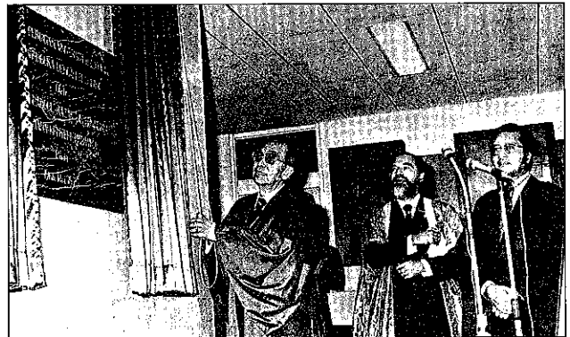
Official opening of the Faculty