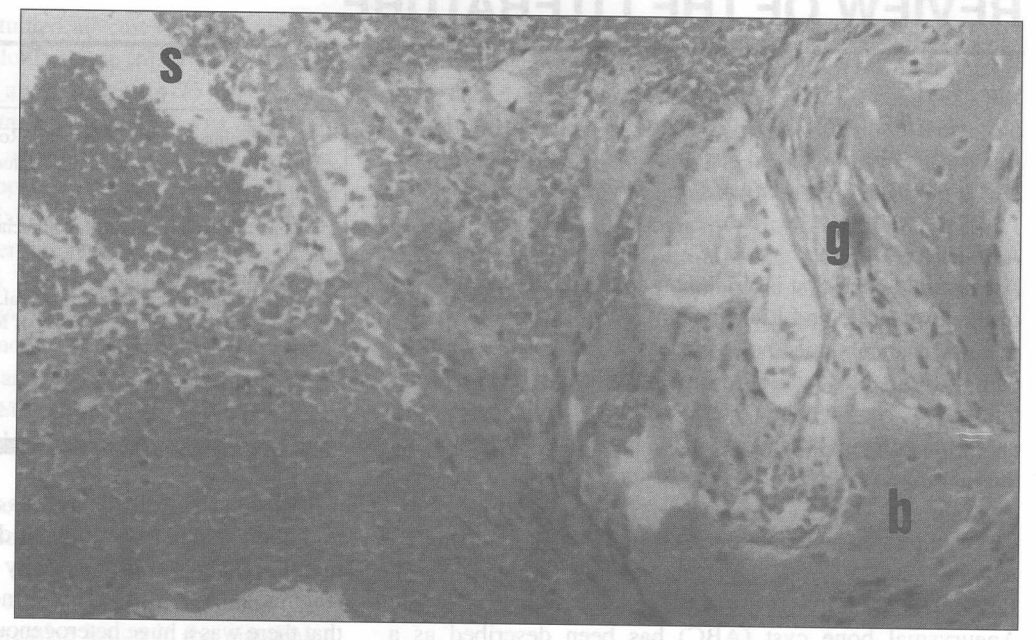
Figure 2. A photo micrograph showing a portion of a large sinusoid(s) filled with blood, a multinucleated giant cell(g) and bone(b). (H & E, Original magnification - 50X)

A dark coloured blood like fluid was aspirated from the lesion. A biopsy of the intra-oral lesion was reported as inconclusive and was composed of fragments of granulation tissue, fibroblastic proliferation, bone with osteoclastic activity and extravasated blood. Based on all the clinical and histological information, a provisional diagnosis of aneurysmal bone cyst was reached with a need to rule out the possibility of a malignancy.