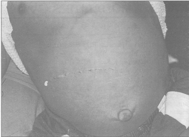
Figure 2: Shows a picture of the abdomen demonstrating hepatosplenomegaly

patient suffered recurrent bouts of fever and cervical lymphadenopathy. He was initially admitted to the Kuching General Hospital and treated with antibiotics but the bouts of fever persisted. He then went on to develop hepatosplenomegaly. At this point he was transferred to Kuala Lumpur for further assessment.