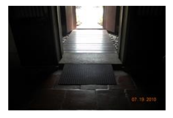
Fig. 5: Portable ramps at threshold of door way in Khoo Kongsi Museum

There are temporary timber ramp at the entrance and portable metal step ramps at threshold of door ways at the ground floor museum area (Figure 4 & Figure 5). The step ramps are constructed with gradient in rang 1:2 to 1:5 which is too steep for wheelchair users. Moreover the portable ramps are not sturdy fixed to floor and are hazardous to their safety. They are added after restoration as claimed by the managing officer in an interview due to a good practice for them to consider accessibility needs visitors with physical challenged. Unfortunately the solution still not well executed to ensure its appropriateness.