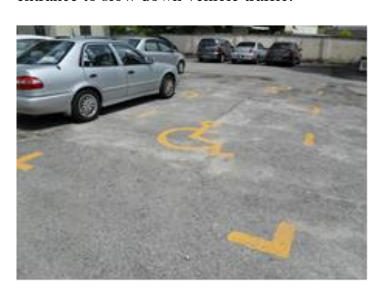
Fig. 10: Accessible parking bay at St. George Church

Among three case studies, St. George Church is the only heritage site which provides accessible car parking bays within the compound. It was located near to the alternative entrance with ramp as shown in Figure 10. Even the ratio in one accessible bay over one hundred standard bays is required in Malaysian Standard yet the managing committee still provides in view of good practice. However, the accessible car parking bay has yet appropriately demarcated to conform the standard requirement especially allocating transfer zone. There is also absence of zebra crossing connecting to the alternative entrance to slow down vehicle traffic.