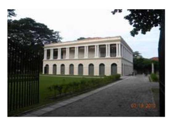
Fig. 2: Concrete pavement demarcates the accessible footpath

Khoo kongsi is finished with granite pavement but uneven surface and big joining gaps might trap wheelchair users and clutches users. Creditably to alley is wide enough for trishaw or car drive through to drop off visitors with permission into the compound. While Suffolk House has well demarcated pedestrian walkway from vehicle driveway access although the vehicle is only allowed with permission to drive