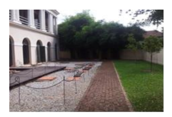
Fig. 3: Fair face brick pavement connects timber ramp to ancillary block at back yard

Suffolk House exemplify footpath network connecting gateway to main entrance with fair case brick pavement and timber ramp leading from main entrance to the annex block behind the main building. The pathway has preferably mapped out and designated a clear footpath to visitors during the restoration. Hence, design is well incorporated with the main building and complement to the landscape of surrounding setting.