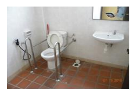
Fig. 8: Accessible toilet at adjacent building of Khoo Kongsi