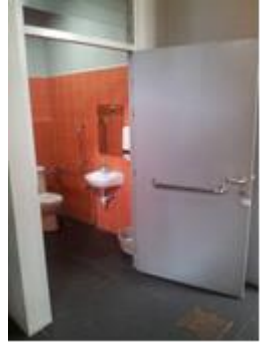
Fig. 9: Accessible toilet at the ancillary building block of Suffolk House

Notwithstanding deficiency in international charter or existing national heritage guidance is recent enough to express accessibility needs of PwDs in heritage sites (Foster, 1997). The study encountered barrier free environment approach likely able to enclave the gaps by 'reasonable accommodation' to certain extend without diminishing heritage value of its fabric.