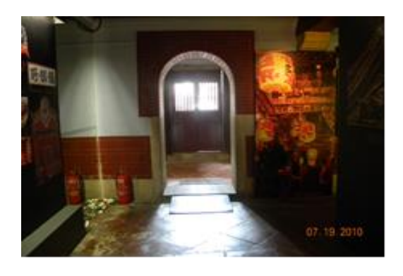
Fig. 4: Timber and metal ramp at the entrance to Khoo Kongsi Museum

In these three case studies, there are ramps being designed for easy access of wheelchair users. Different materials are used to counter the original fabric of the heritage buildings in order to fit authenticity and integrity in conservation practice. They are light and reversible structures without burden to origin of the fabric. Nevertheless, study encountered gradient of the ramps are vary; possibility due to space constraint to allow for sufficient span distance.