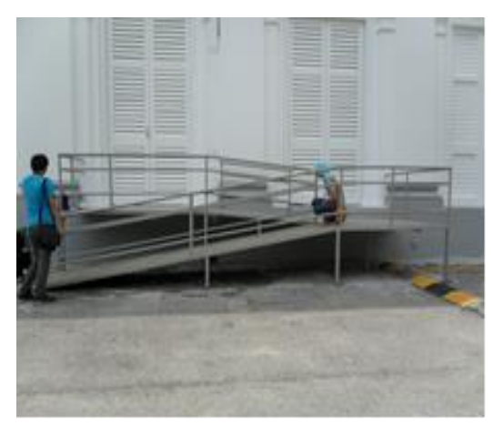
Fig. 6: Additional metal ramp at alterative entrance of St. George Church

St. George Church has been added an alternative entrance with ramp at the side entrance in facing to the open car park area (Figure 6). It was planned in previous restoration in view to cater for visitors with disabilities from an organization who occasionally come for Sunday service. The alternative entrance takes one bay of existing window next to altar shrine of the church. It was designed to ease the four steps at the entrance from ground level with gradient at 1:6. Obviously, it is still steep for wheelchair users to maneuver by themselves and most of the visitors are assisted as claimed by the managing officer during the interview.