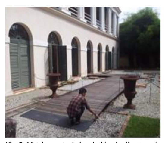
Fig. 7: Metal ramp to timber decking leading to main entrance of Suffolk House

Creditably Suffolk House provides a better example in constructing a gentle ramp of timber decking leading to the main entrance (Figure 7). Gradient at 1:10 is apparently an exemplary in accessibility and subtly integrated with the setting of fabric. The metal ramp is sturdy fixed to the timber decking and well enclosed gaps between the loose gravel and timber platform. The ramp was well thought off to locate at the beginning of the timber platform rather finished right at the raised entrance door way. The timber platform gives a seamless floor level entering to the main lobby area.