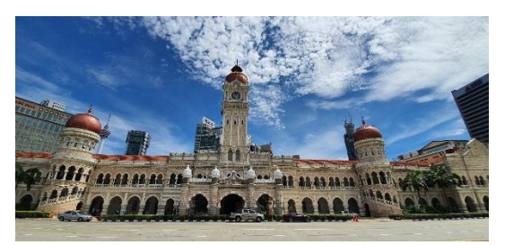
Figure 2: Sultan Abdul Samad Building

The building has three copper onion domes that marked the Moghul style of architecture. The built form is monumental in scale, vertical in height or horizontally massive compared to human proportions and other surroundings. The façade comprised of arches of different patterns such as the pointed arch, ogre arch, horseshoe arch, multi-foiled arch and four-centered arch punching through a red-bricked wall. It is richly decorated with floral finials, embellishments and sculptural elements arranged in a hierarchical organisation at the roof, body and base section. The façade also has a distinct focal point that ideally projects a strong central focus decorated with the center tower equipped with a tower clock and the other two side towers are decorated with arches in a spiral motion, enhancing the overall perceptual stability. This arrangement provides a symmetrical axis and order while adding an element of interest to the bland monotonous façade. The placement of the building is strategically placed in an open ground facing a large square intending it to be noticeable and recognized to signify importance.