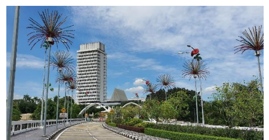
Figure 3: The Parliament House, Malaysia

building. The main building has a Malaccan traditional Malay roof style that definitely defined the Malay architecture. The tower emphasized more on the adaptation of the building towards the surrounding where the facade is being set back to shade the interior from direct sunlight. It carries no racial reference at all and being the taller and more dominant part of the building, it emphasized more on the adaptation of the building towards the surrounding where the façade is being set back probably to shade the interior from direct sunlight. New mechanisms were utilized during that era where steel frames are adapted into its structural system. The Parliament building blends in with the surrounding context and not arranged in a hierarchical manner with widescale base or high scale tapered roof (Mohidin, 2015).