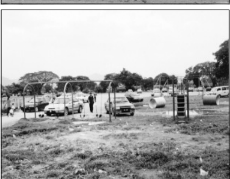
Picture 1: Children will play anywhere, anytime regardless of the settings, but a good furnished and maintained play space are rare in our urban areas.

nowdays often consists of a few pieces of dilapidated equipment in otherwise barren grounds (Teng, 2002, Editor, 2001). Provision for play and recreation is not a priority in most municipalities. Where there are high levels of poverty and a desperate need for health, education, housing and other basic services, investment in children playing facilities may appear to be a frivolous use of limited space and resources(Rani, 1998; Choong. 2000). But even in the poorest neighborhoods, children and their