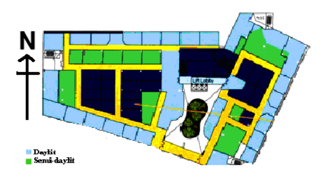
Figure 1: The interior space layout of LEO Building shows the office areas are designed along the facades to maximise the use of daylight

Figures 1 and 2 show that both buildings are L-shaped on plan with the main facades facing north and south. Most office areas are designed along the facades to maximise the use of daylight.