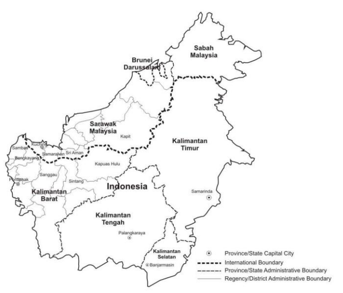
Figure 1: Kalimantan (Borneo) Island