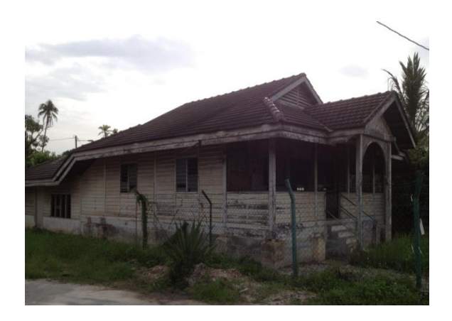
Figure 3: Former post-office

Finally, overall form and material have been shown to serve as important character-defining elements in 100 and 44.7 percent of the buildings, respectively, in terms of aesthetically valuable. For instance, double-story shop houses in a Utilitarian style are not only distinguishable by the overall form of the buildings, but also by the predominant use of timber material. Since places with aesthetic quality are often associated with the sensory perceptions, such as the smell, sound, and appearance of a place (Mason, 2002), it is expected that the character-defining element of sound will have results as well.