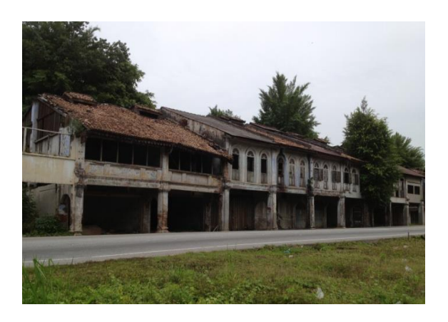
Figure 4: Shop houses along Jalan Gopeng-Ipoh