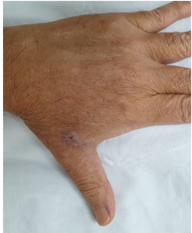
Figure 4: Surgical wound healed at two weeks follow up

The wound was dressed daily, and the patient was discharged on the second day after surgery with oral ampicillin-sulbactam. Follow up review, 3 days later showed a clean wound. Hence, delayed primary closure was performed. Tissue culture grew methicillin-susceptible Staphylococcus aureus . Antibiotic was stopped after a 7-day course. On follow up visit, 2 weeks later, the wound had healed (Figure 4) and there was full range of motion of the thumb. The patient was grateful and relieved that his condition had resolved rather quickly.