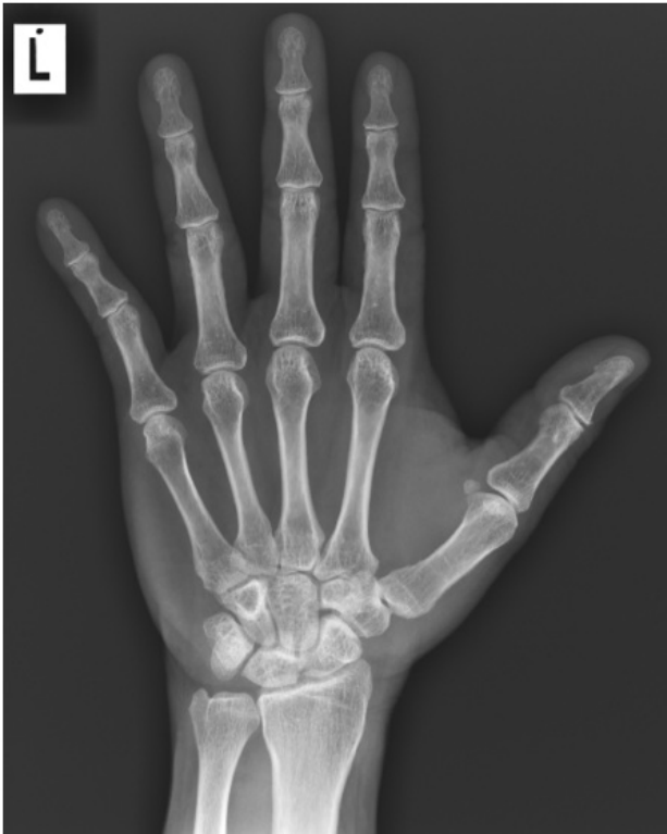
Figure 2: Plain radiograph showing increased soft tissue density at the first web space with no obvious foreign body visible

However, the patient returned to the casualty 2 days later as the swelling had ruptured. There was minimal seropurulent discharge from the ruptured swelling. He was admitted for debridement and exploration. Intraoperatively, two pieces of wood measuring 2.5 x 0.6 x 0.3 cm and 0.5 x 0.3 x 0.2 cm were found within the subcutaneous layer of the dorsum of the first web space just beneath the skin and they were extracted (Figure 3A, 3B). The surrounding subcutaneous tissues were unhealthy. The foreign body tract was in the direction of the healed entry wound and the tract was curetted. The healed entry wound skin was left intact. Tissue sample was sent for culture after which intravenous ampicillin-sulbactam was started.