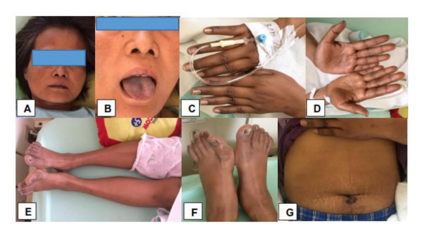
Figure 1: Skin darkening in the patient: (A) face (lips); (B) tongue and oral mucosa; (C-D) upper extremities; (E) lower extremities; (F) toenails; and (G) abdomen

On physical examination, there was skin darkening on the face, the upper and lower extremities, and the oral mucosa. The lips and gums were hyperpigmented (Figure 1A-G). The patient was generally weak, but had good consciousness. Blood pressure was 110/80 mmHg, pulse 104 times/min (regular), breathing 20 times/min, and axillary temperature 37°C. Weight was 50 kg, height 155 cm, and body mass index 20.8 kg/m².