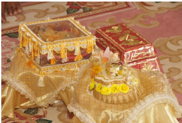
Photo 2: Tepak Sirih covered with gold embroidered velvet are used during the ceremony.

Representatives from the male's side would bring a few items as gifts to accompany the tepak sirih and a ring for the engagement ceremony. Exchanging gifts from two sides (male and female) was conducted after the representatives of both party were satisfied with the discussion. The discussion during the engagement ceremony would be related to the bride's dowry, date and time of wedding ceremony and also the mahar (in Islam this is a compulsory gift from the groom to the bride). Implicitly engagement customs symbolize that the man and the woman would become husband and wife within the period of time that was agreed to in a family organized ceremony.